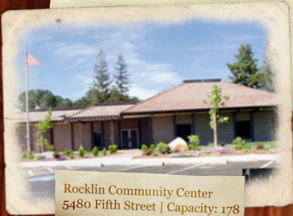
Rocklin Community Center 5480 Fifth Street | Capacity: 178

Check out the Rocklin Business Discount Reserve by June 30 to enjoy 15% off your Rocklin Event Center rental. Hold your next 2012 business event here. Applies to any Event Center room!