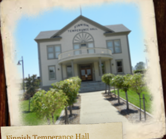
Finnish Temperance Hall 4090 Rocklin Road | Capacity: 144