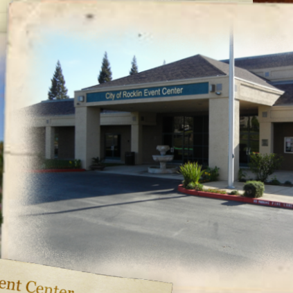
Rocklin Event Center 2650 Sunset Blvd. | Capacity: 320