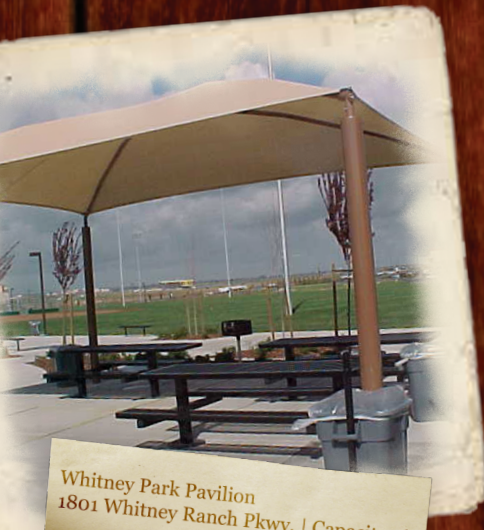
Whitney Park Pavilion 1801 Whitney Ranch Pkwy. | Capacity: 65

$20/hour SPECIAL Recreation Meeting Room Through June 30, enjoy discounted rental rates of the meeting room at Rocklin Parks and Recreation Office. Great for trainings and small events. 840 sq. ft. - seats 30 comfortably.