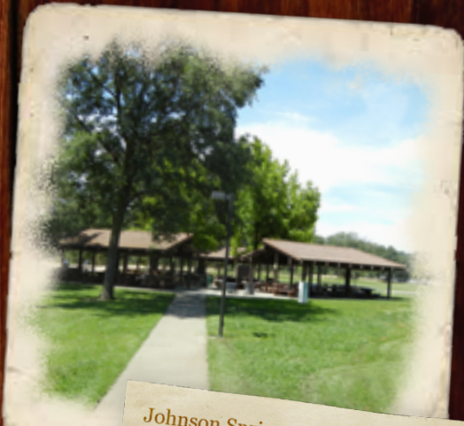
Johnson Springview Park Pavilions 5480 Fifth Street | Capacity: 330